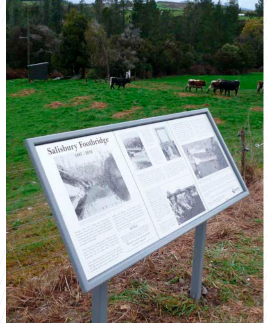
bFrame. Upright, 3 tile